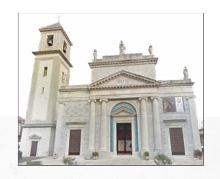
at the Parish of Sant'Andrea Ap. #36 Paolina Bonaparte street Viareggio (Lucca) Italy