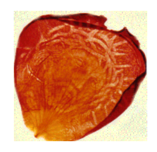
The Lord bless you and keep you; The Lord make His Face shine upon you, and be gracious to you; The Lord lift up His countenance upon you, and give you peace. (Num. 6:24-6.)