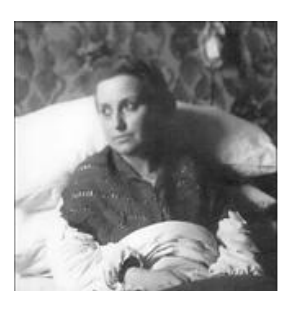
"Lord, I do not ask You for the glory of your visions, but for the grace to love You more and more." ( Notebooks 1944, p. 439.)

New email address: <u>david@valtorta.org.au</u>; Web-site: <u>www.valtorta.org.au</u>